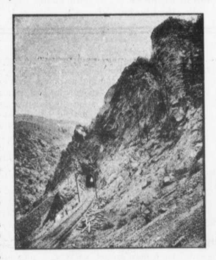
BLACK CRAGS IN UTE PASS

"Why does a stranger," he said, drawing himself up to full height, "drink from the