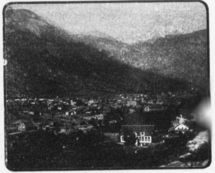
MANITOU, AT FOUT OF PIKE'S PEAK

TELL me all the good you can about the people that you know. Tell me only the good about the people of whom you speak. Tell me the things which will make me think well of the people and of life. Tell me the things which will make my sun shine, my heart glad, and my soul to rejoice. Tell me the things which will straighten up my thinking, and give me