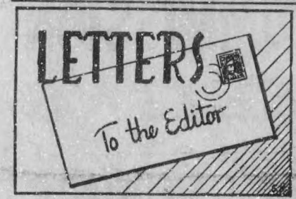
Editor, The Brunswickan,