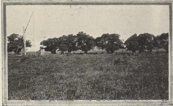
"The willows stood out in bold relief."

so many years of neglect, 1907 will surely see this land, replete with the history of an unfortunate people, dedicated to the memory of those who once were here.