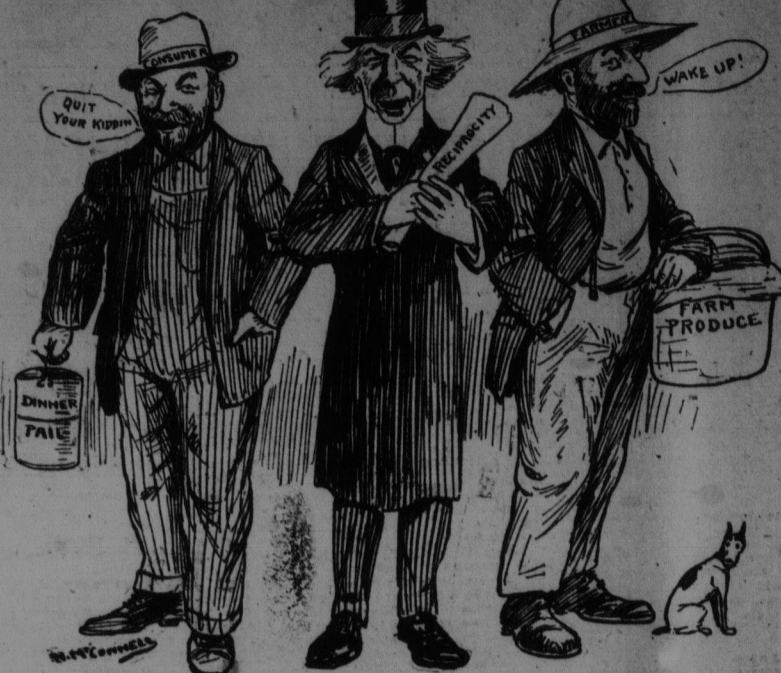
SIR WILFRID—"This tariff treaty will make prices lower to the consumer and higher to the farmer."