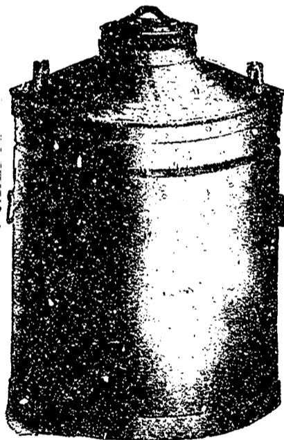
"EMPIRE STATE" MILK CAN