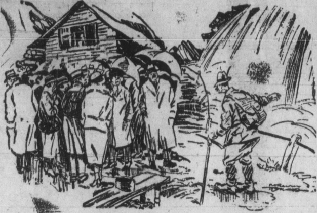
Guide: "This is the largest waterfall in the Alps. Would the ladies cease talking for a few minutes so that we may hear the roar of the water?" From the London Mail.

Customer—Is this a good brand of perfume? Salesgirl (recently transferred from book department)—Oh, my, yes! It's one of our six best smelling.