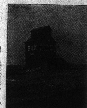
B. & K. ELEVATOR.