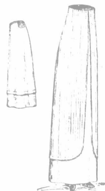
7269 Skirt with Tunic Effect, 22 to 30 waist.