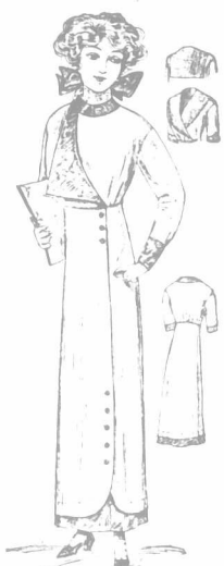
7272 Semi-Princesse Dress for Misses and Small Women, 14, 16 and 18 years.