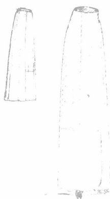
7261 Four-Piece Suit with Two Lower Skirts, 22 to 32 waist.