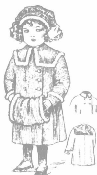
7267 Child's Kimono Coat and Muff, 1, 2 and 4 years.