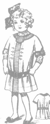
7257 Child's Dress, 4 to 8 years.