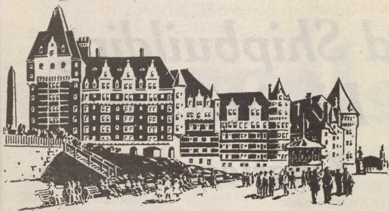
CHATEAU FRONTENAC, QUEBEC.