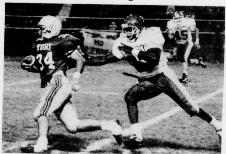
York Yeomen football player tries to elude UofT player. York lost the game 40-3 to continue their losing streak. The Yeomen have now lost 29 games in a row.

They moved the ball deep into Toronto territory, however they could