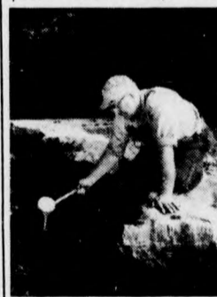
Our own iron-free water

AT THE JACK DANIEL DISTILLERY, we have everything we need to make our whiskey uncommonly smooth.