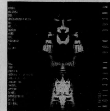
VARIOUS ARTISTS MACRO DUB INFECTION VOLUME TWO

I'm not quite sure how to take this collection of Euro-techno/dance music. On the one hand I do like techno, trance and surreal music, even if a lot of it sounds repetitious. However, a lot of the tracks from this second volume sound too repetitious and bland. This is a conglomeration of European artists who present a rather psychedelic headtrip through electronic instrumentation, remixing and soundbytes. The music is not meant to be listened too in any "relaxing" atmosphere, and more properly belongs in raves and really hard-core dance clubs.