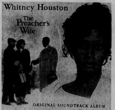
WHITNEY HOUSTON THE PREACHER'S WIFE

Exhale, which featured some songs from White