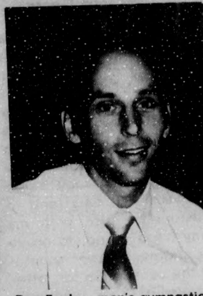
Don Eagle men's gymnastics

"We will be an even more exciting team this year. We are fortunate to have the core of last year's team returning and we will be challenging for top honors in the AUSA championship."