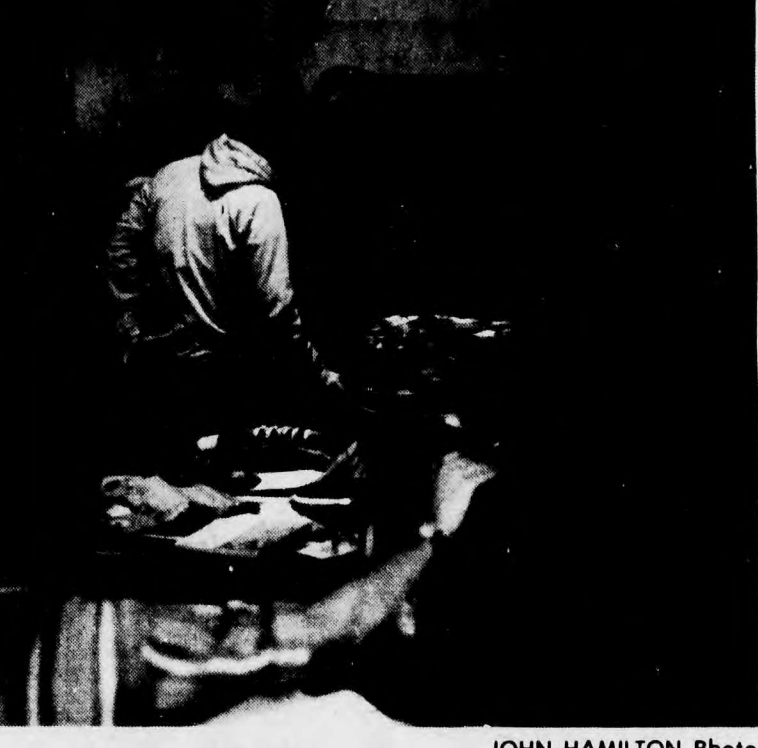
WUSC's bazaar of objects from around the world