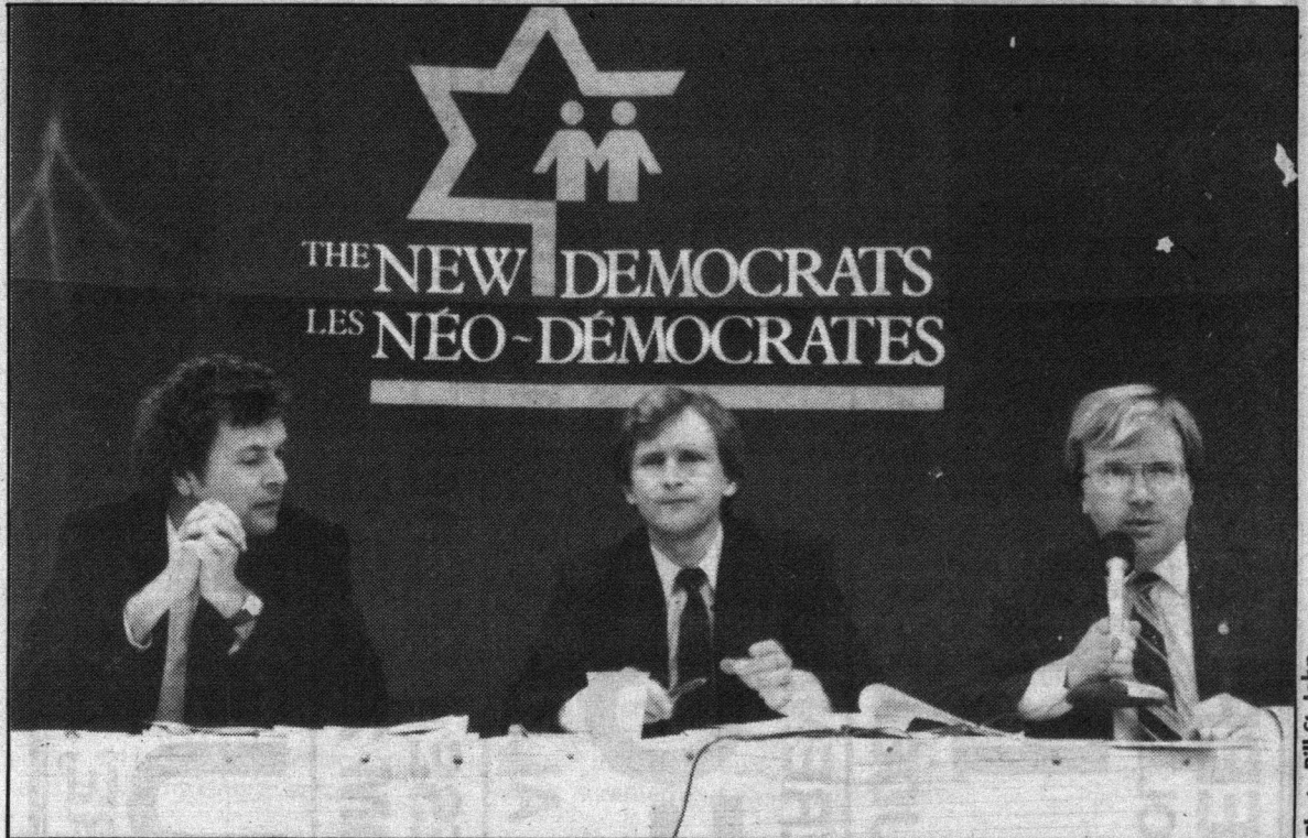
The NDP unemployment road show Nystrom, Langdon and Riis heard citizens' cures for an ailing economy at a Tuesday hearing on campus.

Riis jokingly concluded: "I'm going to say something no politician has ever said before. You (the audience) said it all!"