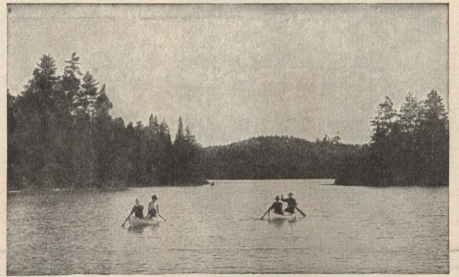
On the Montreal River, Temagami.

Black bass, speckled trout, lake trout, wall-eyed pike in abundance. Moose, deer, bear, partridges and other game during hunting season.