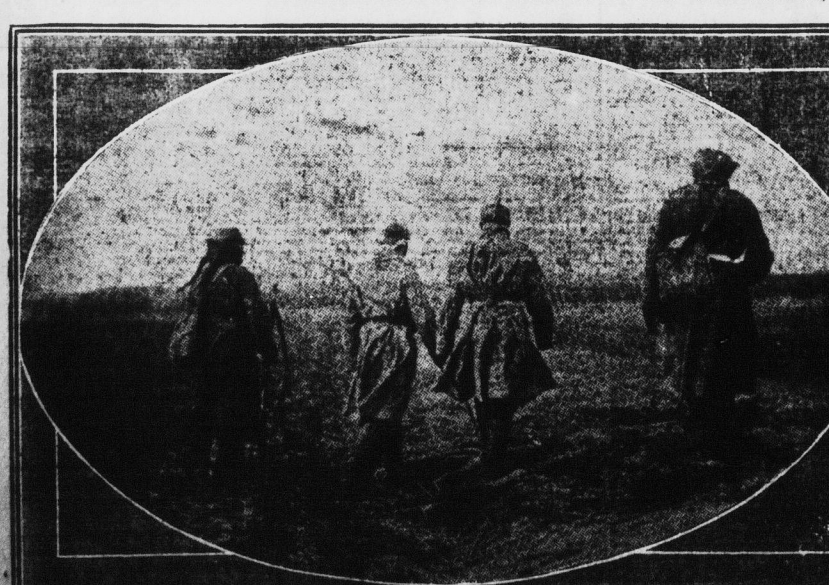
RUSSIAN INFANTRYMEN BRINGING IN TWO GERMAN PRISONERS. This scene was taken behind the Russian line defending Warsaw and shows two German prisoners being brought in by Russian infantrymen. The prisoners were captured in one of the recent attacks on the Russian strong hold, which has been the centre of violent activities.