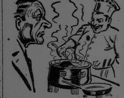
The Dyspeptic: "How can a man live in a small like that?"

It is time to pay attention to your stomach when the sight or the smell of food makes you sick, for were this not the fact the stomach would not cause such disgust upon the part of the sense of smell and taste when meal time comes around. All the world has to eat. You men who walk to your meals like you do to a drug store for medicine, should once realize that there is a relief for you. This relief is Stuart's Dyspepsia Tablets.