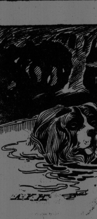
They would take a dip in the clear, cool water of the fast running creek.