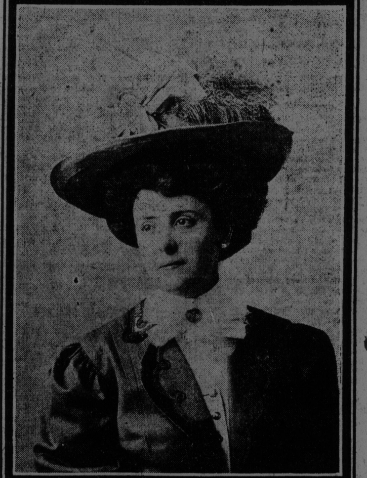
FRENCH FELT TRIMMED WITH THE FASHIONABLE GOURAS PLUMES

The gouras feather is one of the distinctive styles noted of the season. It is "feathery" in the extreme, and has an air of fragile and delicate lightness, although it is in no sense what one might call a perishable trimming.