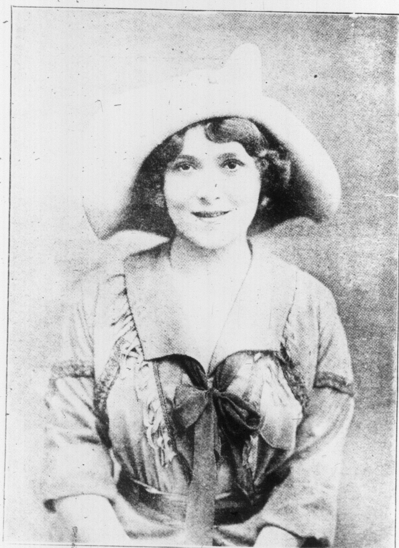
MISS SARI PETRASS, AN HUNGARIAN BY BIRTH, WHO WAS DISCOVERED AT VIENNA BY MR. GEORGE EDWARDS. SHE HAS GAINED A FIRM HOLD UPON THE AFFECTIONS OF LONDON PLAYGOERS.