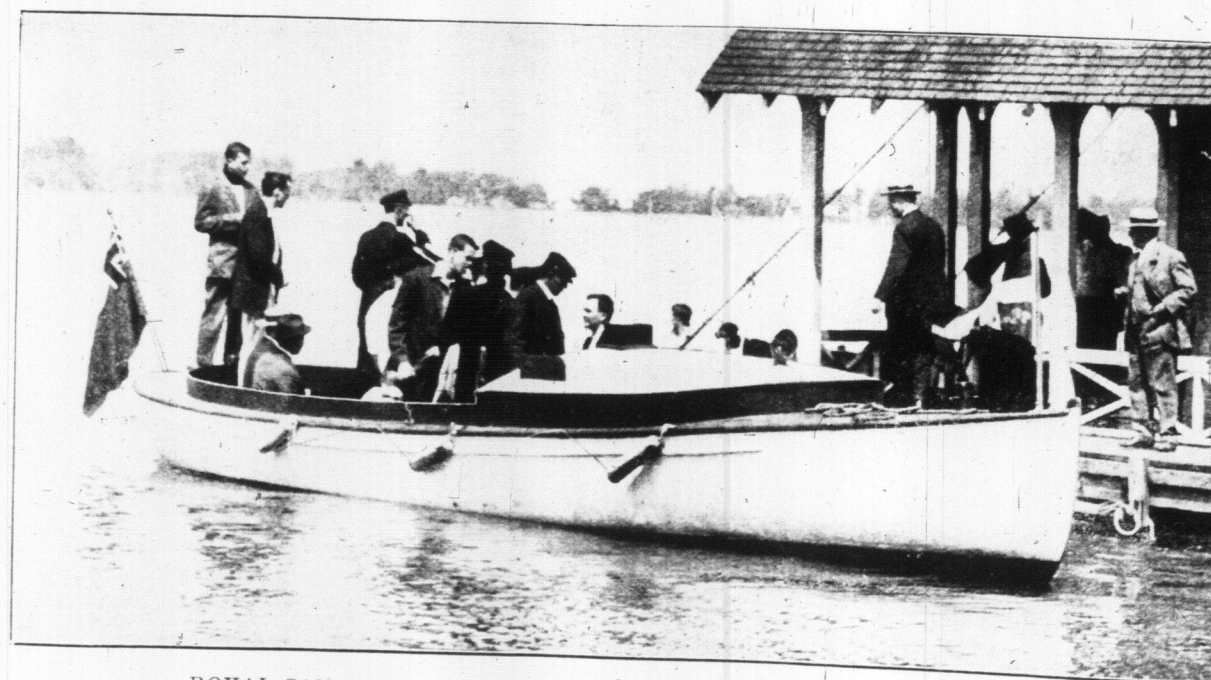
ROYAL CANADIAN YACHT CLUB TENDER GOING OUT TO THE FLEET.