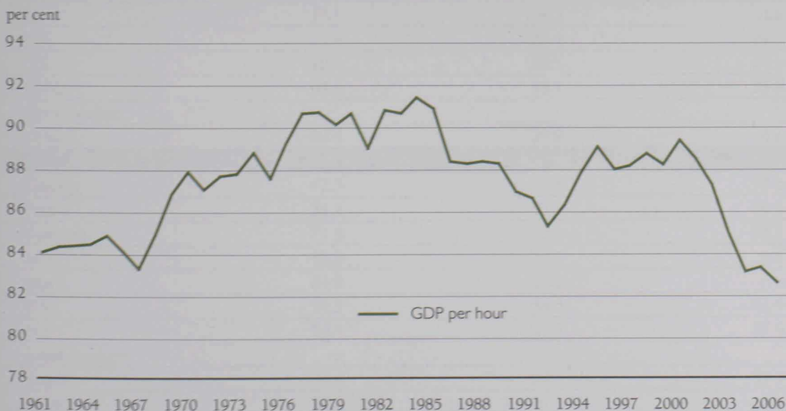
FIGURE 3-9 Relative Labour Productivity Levels in the Total Economy in Canada, (Canada as % of the United States)

Comparisons to the U.S. are natural as it is Canada's largest market and biggest competitor, as well as being the most dynamic economy in the world. But there are an increasing number of other countries which are also outperforming Canada in terms of productivity performance. Not only are Germany, Ireland, Italy, the UK, Sweden, Netherlands, Denmark, Belgium, and Austria outperforming Canada, but France, Luxembourg and Norway outperform both Canada and the US. 4