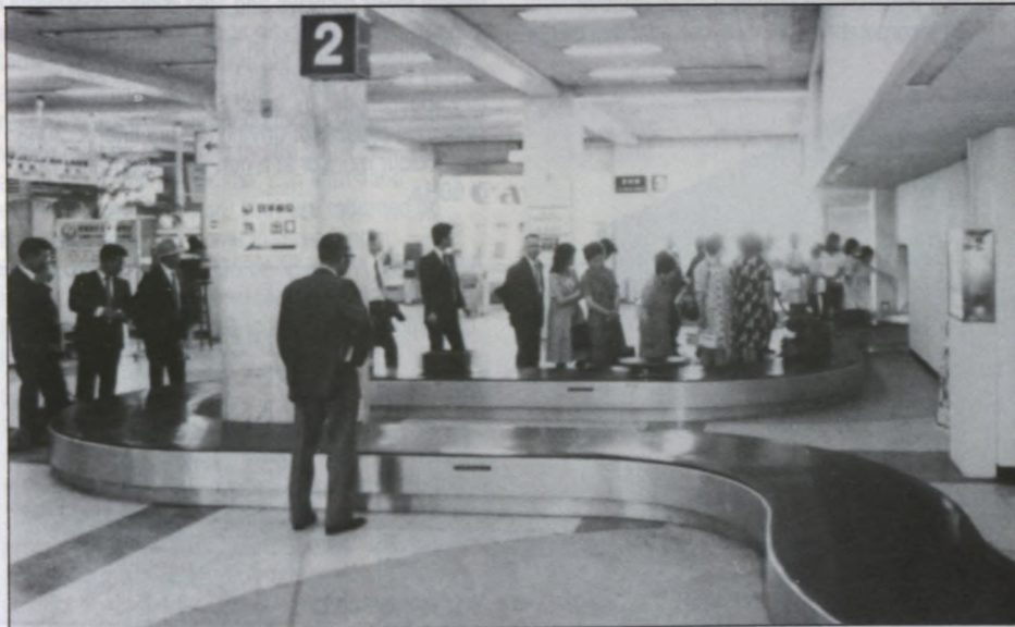
Mono-Planar conveyer unit

Rapistan, an organization with a broad international pool of material-handling knowledge and experience, has manufactured and installed conveyerized baggage handling systems at more than 150 airports in locations that include Algeria, Brazil, the Caribbean, Central America, Egypt, Europe, Indonesia, Japan, Jordan, Kenya, Nigeria, Saudi Arabia, the United Kingdom, the United States, the Soviet Union and Venezuela. Rapistan offers the following: advanced consulting services to clients contemplating major additions or reorganization of their baggage handling operations; design services to achieve efficient baggage handling systems; on-site implementation and installation to assure proper equipment performance; and equipment maintenance services. Rapistan, with a 7 430 m 2 (80 000 sq. ft.) modern manufacturing facility located in Mississauga, Ontario, has a staff of approximately 120 employees. Rapistan manufactures products for outbound check-in applications, outbound baggage transportation, outbound baggage make-up, inbound baggage unloading and transportation, inbound baggage claim, and customs inspection.