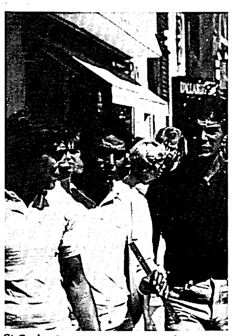
St-Catherine Street, Montréal.

Referring to "a new era for sponsors and their relatives", the Minister of State described quality-of-service measures such as a reduced waiting period for sponsors and less complex applications. Sponsorship provisions have also been broadened, allowing for individual determination of each sponsor's obligations and expanded