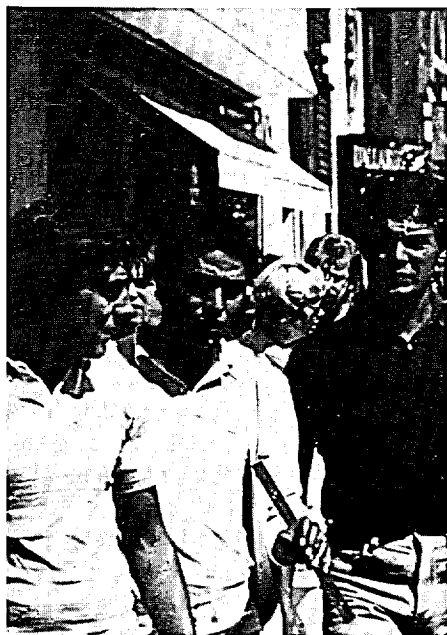
St-Catherine Street, Montréal.

criteria for measuring family financial resources.