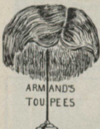
Style 37.—This is a most natural GENTS' TOUPEE. Why go bald when we have such imitations of natural? Prices range from $15.00 to $50.00.

We are offering sweeping reductions in our beautiful $10.00 and $12.00 Switches, all long hair, short stem, in any color but grey and rare shades.