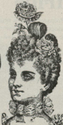
Latest style COIFFURE, with parting to one side; curly front. If you want your hair becomingly dressed always go to Armand's. Everybody will tell you so.