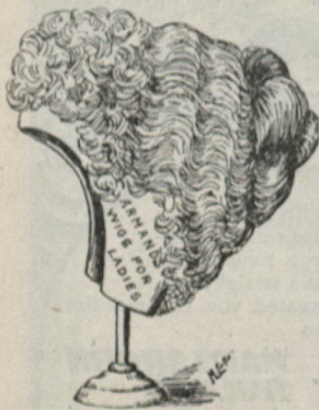
Style 32 is a beautifully made LADIES' WIG, on the most improved and hygienic principles, entirely perforated foundation, with open centre to allow the air to penetrate to the scalp. Prices from $20.00 to $75.00.