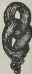
Style 41 represents a COIL-CHIGNON, made from a Natural Wavy Switch. Price, $8.00.

Have you Grey Hair or Beard? If so, use ARMAND'S EXTRACT OF WALNUTS. Any shade can be obtained by simply diluting with water. The effect is instantaneous. It is easy to apply and free from any injurious ingredients. Price, $1.50.