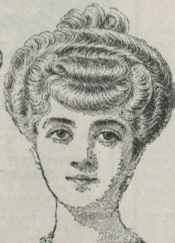
This pretty and becoming STYLE OF FRONT is made on a comb, has soft curls all along the forehead. Prices from $10.00 to $20.00.