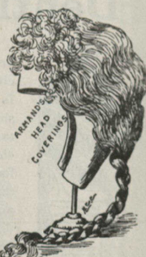
Style 20 is a pretty FRONT, with long hair on the back to cover the thin part of the head. Prices from $10.00 to $20.00.