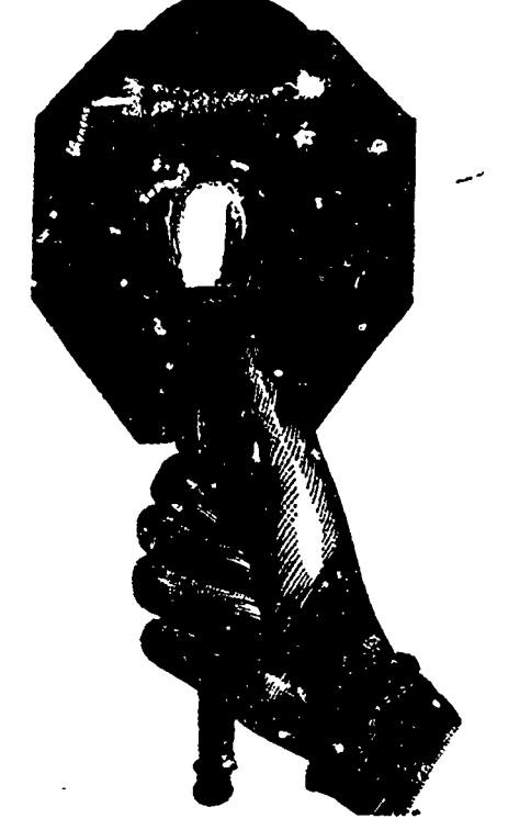
Fig 1.—The Ovoscope.

"The instrument is used as follows: taking the ovoscope in the right hand, with the thumb on the fluting of the cup,