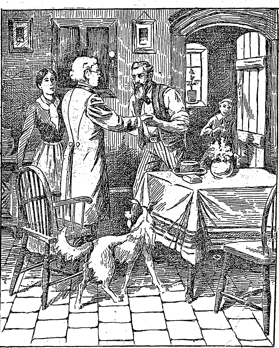
HOW TO ENJOY RELIGION.

'Now do you know for what you are to pray? You are to say "O God" because He made you, and gives you daily your