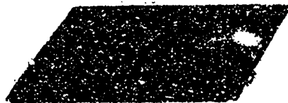
Patent Safe Lock Shingle.