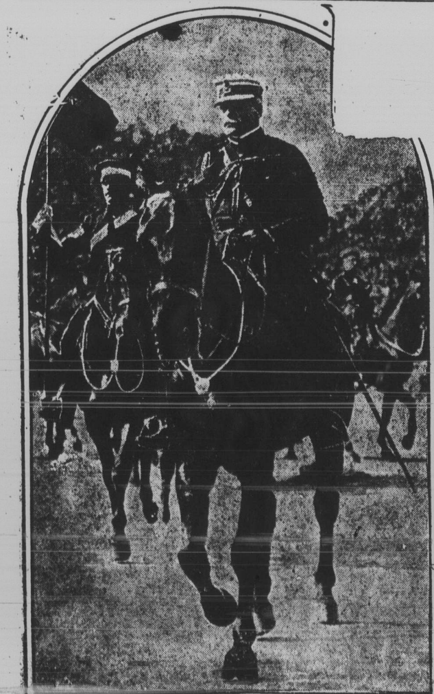
SIR DOUGLAS HAIG, Commander in Chief of British Forces, France.

ered that the dust from the streets or the flies cannot come in contact there- with.