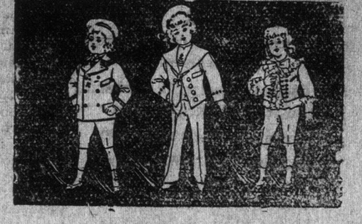
Sale Prices for Cash.