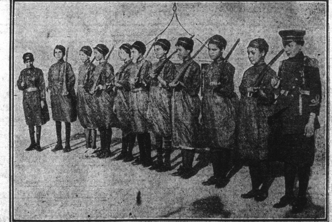
ENTERTAINING BRITISH SOLDIERS IN EGYPT Coptic girls who performed a military play before the audience of British wounded soldlers in Egypt. They were delighted to entertain the men—London Daily Mirror photo.