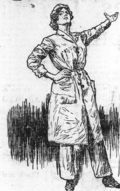
This illustration shows one of the women workers at Port Sunlight in her becoming and unbecoming costume.