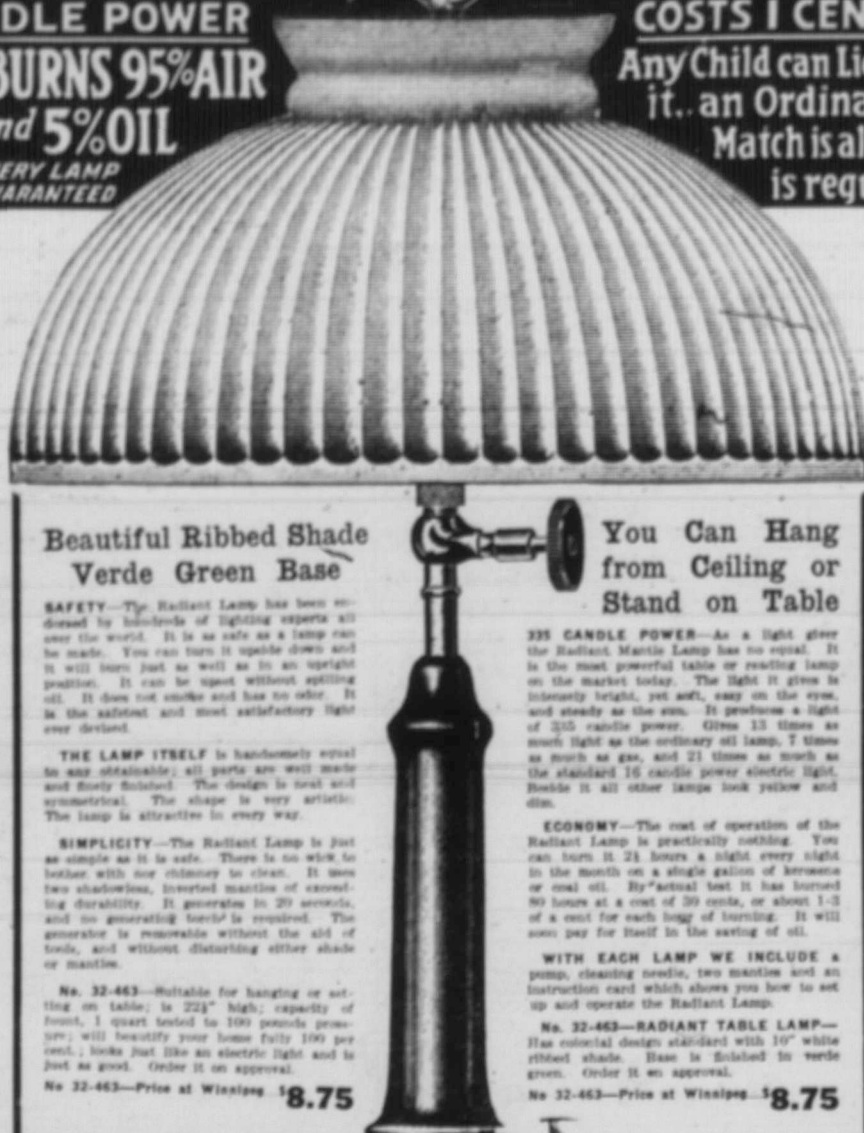
Beautiful Ribbed Shade Verde Green Base

LARGE SQUARE FULL SIZE OVEN —Constructed with great care, so that it will bake to perfection with the least possible labor and fuel. No oven ever baked more evenly or quickly with so little fuel. OVEN DOOR is strong and solid, opens level with the oven bottom. COOKING TOP AND COVERS —Extra heavy, made from highest grade stove plate. Have five solid covers and one three-ring sectional cover made to fit different size utensils. This lid fits in any of the six cooking holes; a convenient feature. FIRE BOX has heavy three-section back, duplex grate, heavy front end lining. Ash pit has large hinged pan and ash pit filled with ash chutes. WARMING CLOSET —Easy to reach and unusually on the contact principle. The water heats quickly. OVEN is extra large and deep. Made of one sheet of cold rolled steel and strongly braced on top and bottom. Oven front and feed and ash pit door are full nickel. No. 89—18-inch oven $49.50 No. 109—20-inch oven $53.50