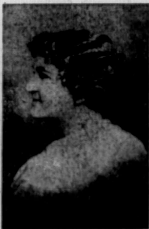
NELLIE MCCLUNG Author of "The Next of Kin"

Again this popular author has endeared herself to her great galaxy of readers. The 16 brief tales of this book are bound together by the same thing which draws the people who figure in them—the war. For the author is concerned with the way in which war and the sacrifices made for it and the burdens borne for it touches those whom she knows best, the women of Canada. With few exceptions these are stories of women who have given up their sons, of others who are widowed, because they cherish the idea of the British Empire and are ready to give bread and blood, the "sacrifice of Empire," to save it. And almost every one is a story of cheerful sacrifice or of proud courage in sorrow. There is the story of the woman who has lost three sons and who came down to the station to see the other boys off, in the hope of adopting one of them, to be a war-mother to him. This is matched by that of the wife of the disciplinarian doctor, whose recruiting speeches give her courage to defy him and adopt two small children orphaned through the war.