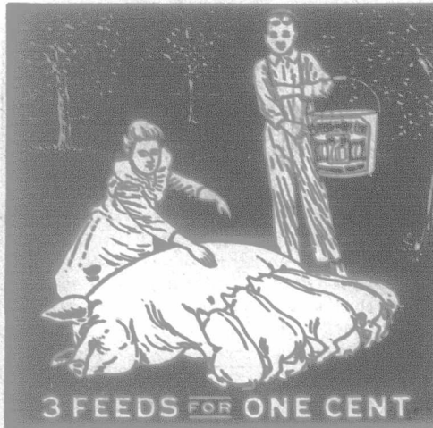
3 FEEDS FOR ONE CENT