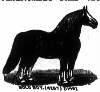
IS AT THE HEAD OF OUR STUD.

ing. Come and see us or write for particulars.