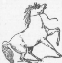
Book Teaches Horse Taming

away free to our people who will send us two new subscriptions to Farm and Dairy each taken at only $1 a year. The book will be sent postage paid and free of all cost to you on receipt of the two new subscriptions.