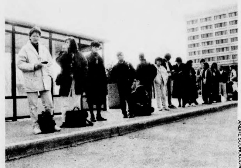
LEFT OUT IN THE COLD: Hundreds of York students were forced to stand outside and face the elements because of the lack of bus