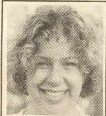
WSWIM: Meet Win