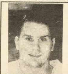
HOC: 3 wins (beat #1 Acadia)