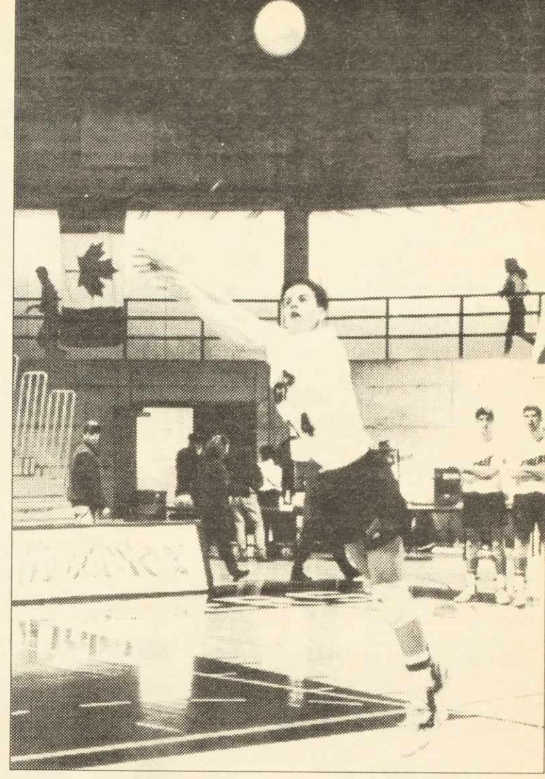
The men's volleyball team defeated Queen's Golden Gaels to win the Lawton's Volleyball Classic at Dalplex last weekend.

ted 13 points each. Mary's this Friday. The women play at 6 p.m. while the men follow at 8 p.m. Sunday the women host UPEI