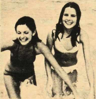
The internal protection more women trust

Wherever there's water, there you are. Swimming every day. Protected, sure of yourself because you use Tampax tampons.