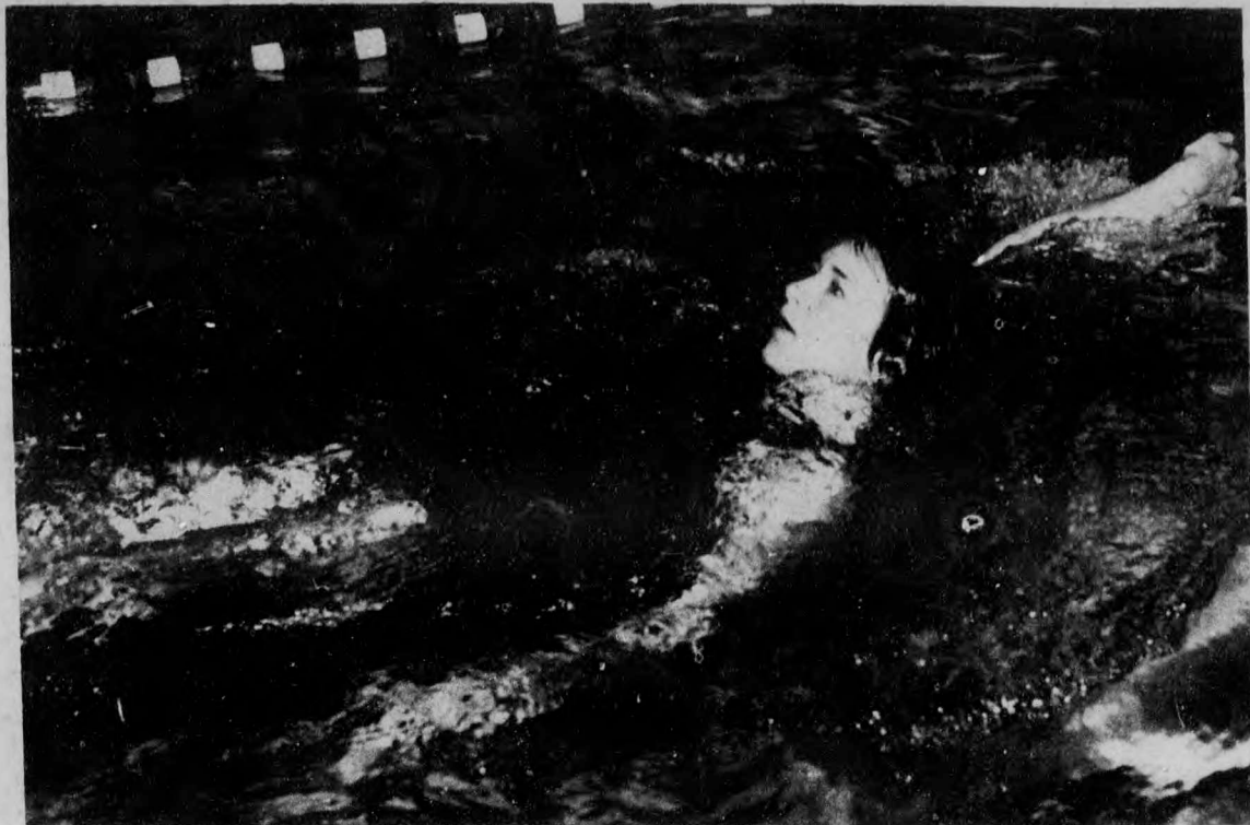
A Mermaid showing the back stroke style during one of the daily swim practices, is a common sight every afternoon from 4:30-5:30, when the Mermaids show their versatility in a variety of strokes.

"Our girls have a special dedication, they train 4 to 5 hours in the pool and 2 to 3