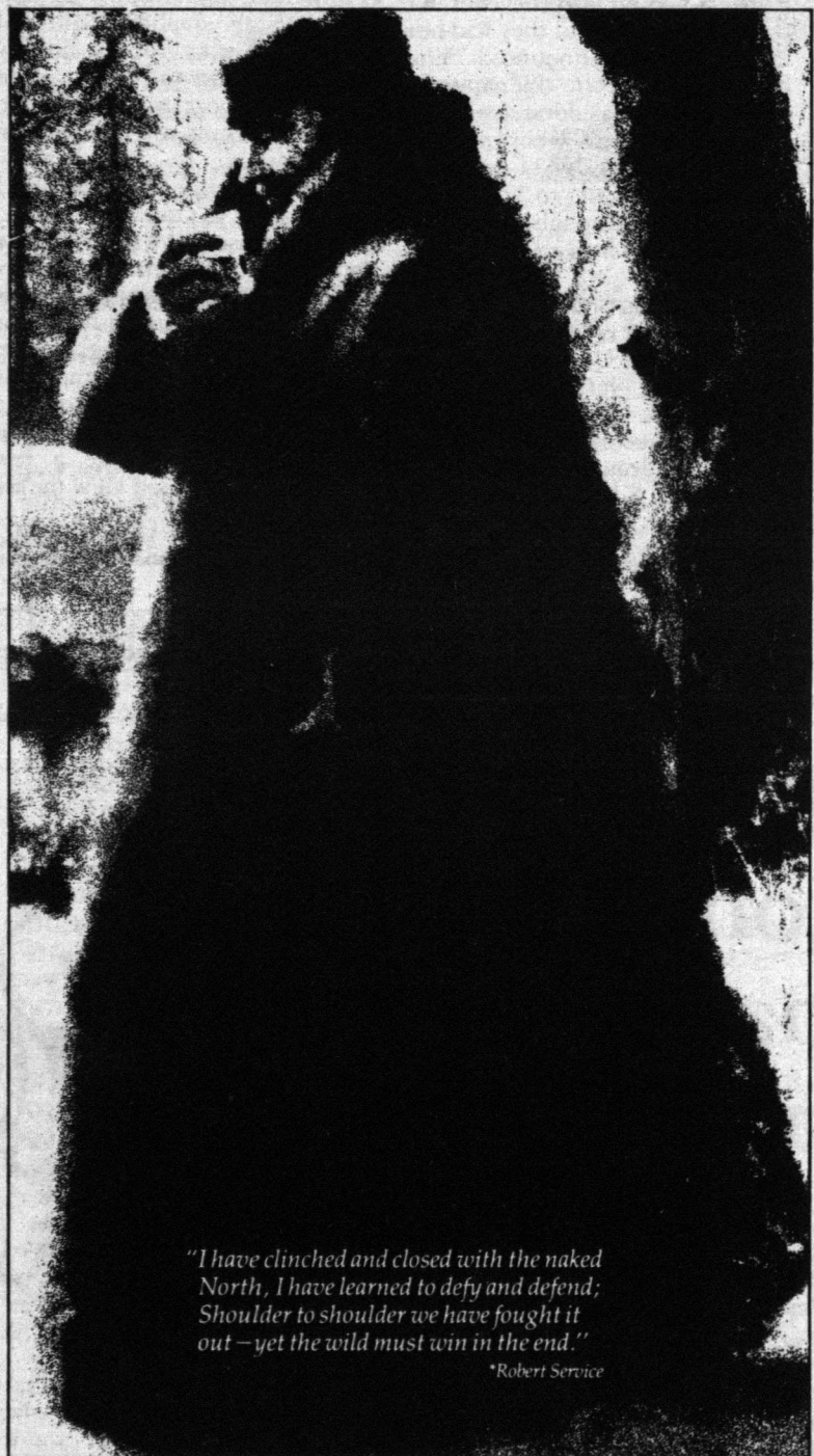
"I have clinched and closed with the naked North, I have learned to defy and defend; Shoulder to shoulder we have fought it out - yet the wild must win in the end." -Robert Service