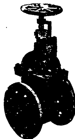
Indicator Gate Valve.

Railway Supplies, Structural and Ornamental Iron Work