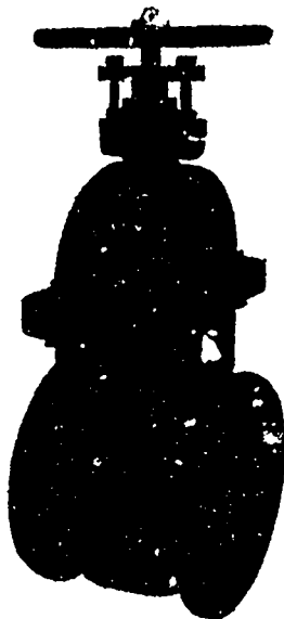
Flanged End Gate Valve with Hand Wheel.