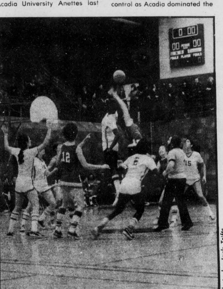
UNB Red Bloomers are blazing to the top of the Atlantic division standings again this year.

The UNB Red Bloomers are one step closer to winning the Atlantic title in Women's basketball following a win against the Acadia University Anettes last