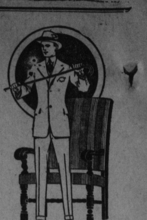
A man's carriage, conversation and clothes reveal his character. Here is an upstanding suit that will be a credit to any man's character.