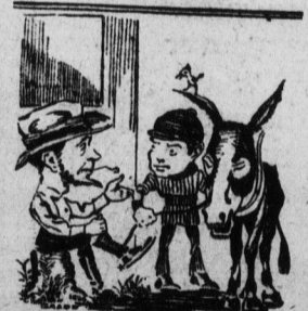
A SETTLED RULE.

The Major—What makes you so sure that old mule can stand another day's work? The Muleteer—Cause he always has, sir.