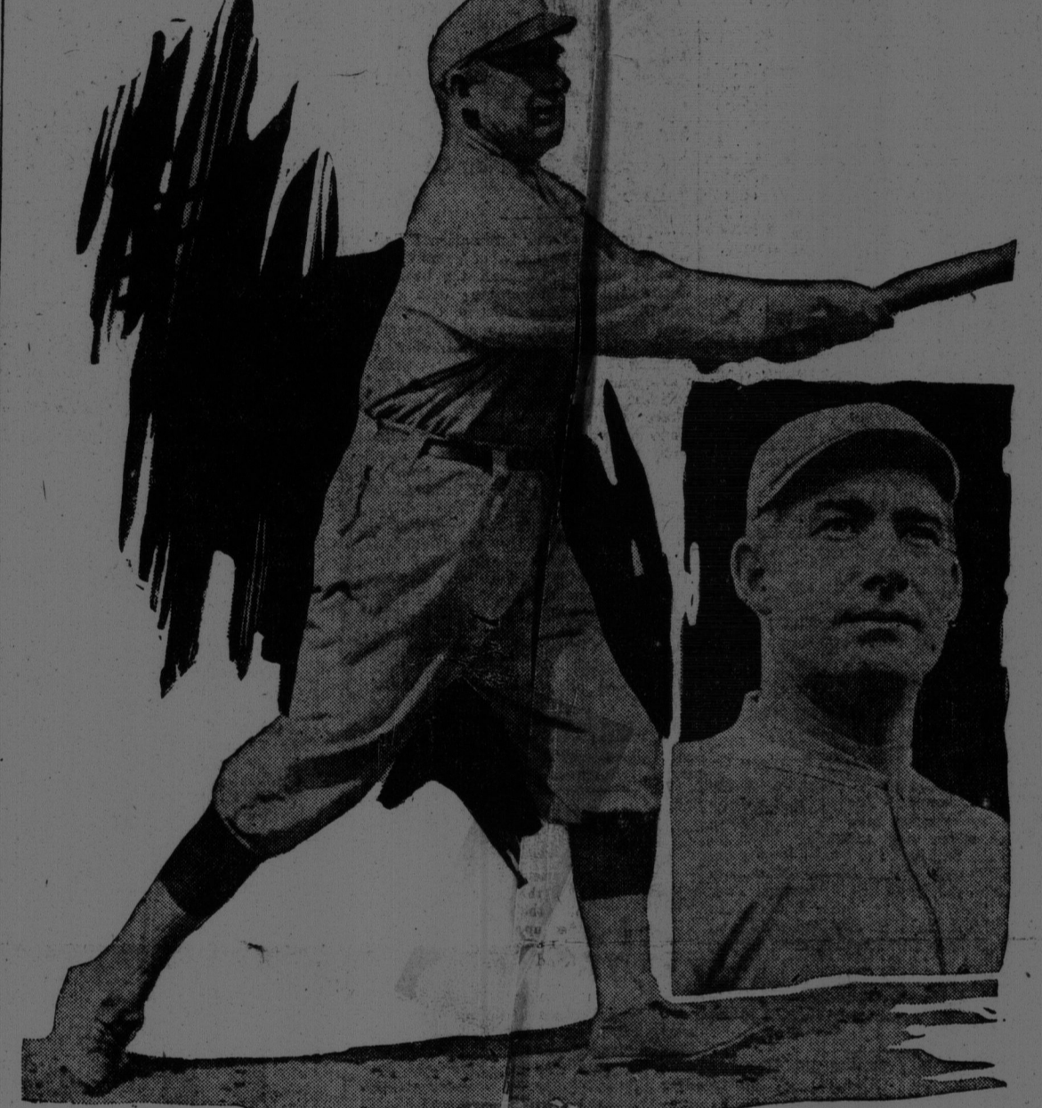
ROGER BRESNAHAN

St. Louis, Oct. 31.—The removal of Roger Bresnahan as manager of the St. Louis National baseball team was not wholly unexpected in view of the numerous reports of the last year.