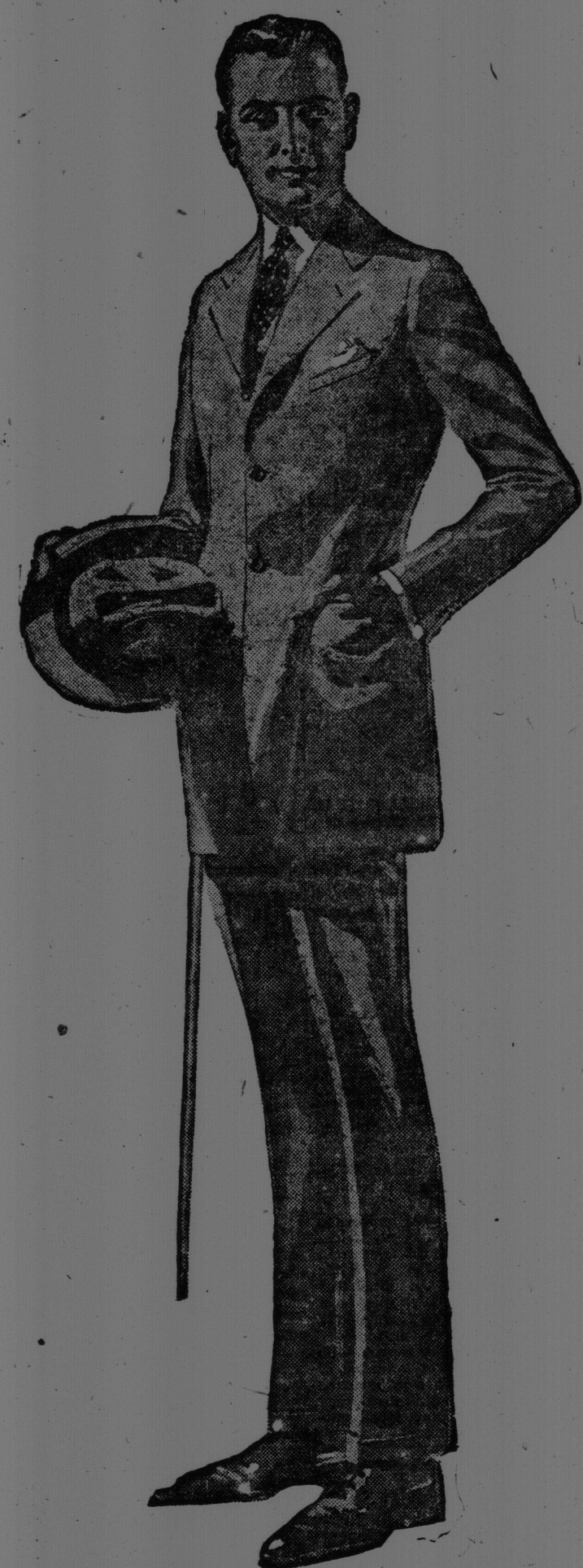
SEE THESE IN OUR WINDOWS

MEN'S CLOTHING—SECOND FLOOR. OAK HALL - SCOVIL BROS., Ltd. King Street.