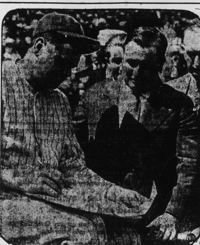
The largest contract of its kind ever signed in vaudeville is shown here receiving the name of the King of Swat. Ruth will receive $100,000 for a 12-week tour over the Pantages western circuit after the next world series. The Bambino will appear alone, with no supporting cast. E. G. Milne, Pantages representative, is shown above with Ruth.